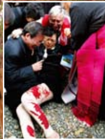
Bloody marks of scourging