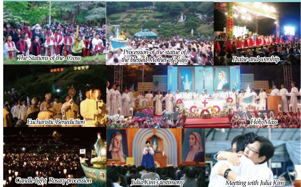
The Stations of the Cross