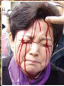
The pains and bleeding from the Crown of Thorns