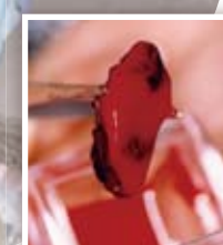
Descent of Precious Blood