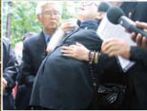
Pains of reparation for the sins of abortion and obscenity 2014