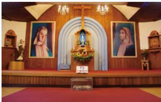
The Blessed Mother's House

“Mary’s Ark of Salvation, this is my bosom of love, greater than universe” (Message from the Blessed Mother on May 8, 1991)