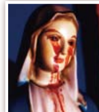
Tears of blood