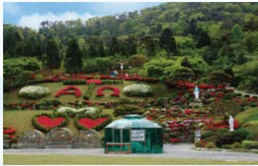
The Blessed Mother's Mountain